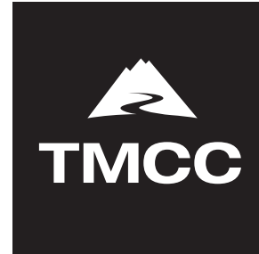
TMCC logo-bw block PC

These logos are the black or white options available for use in publications and on the web. Black logos are shown below – white variations will be identical (but in white). File names are listed below each logo.