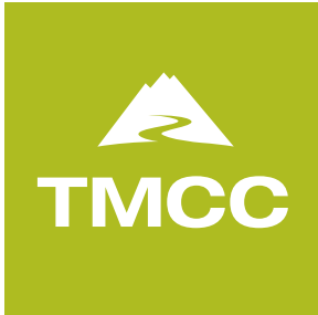
TMCC logo-1pms block PC

These logos are the one-color option available for use in publications and on the web. File names are listed below each logo.