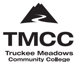
TMCC logo-bw wname PC